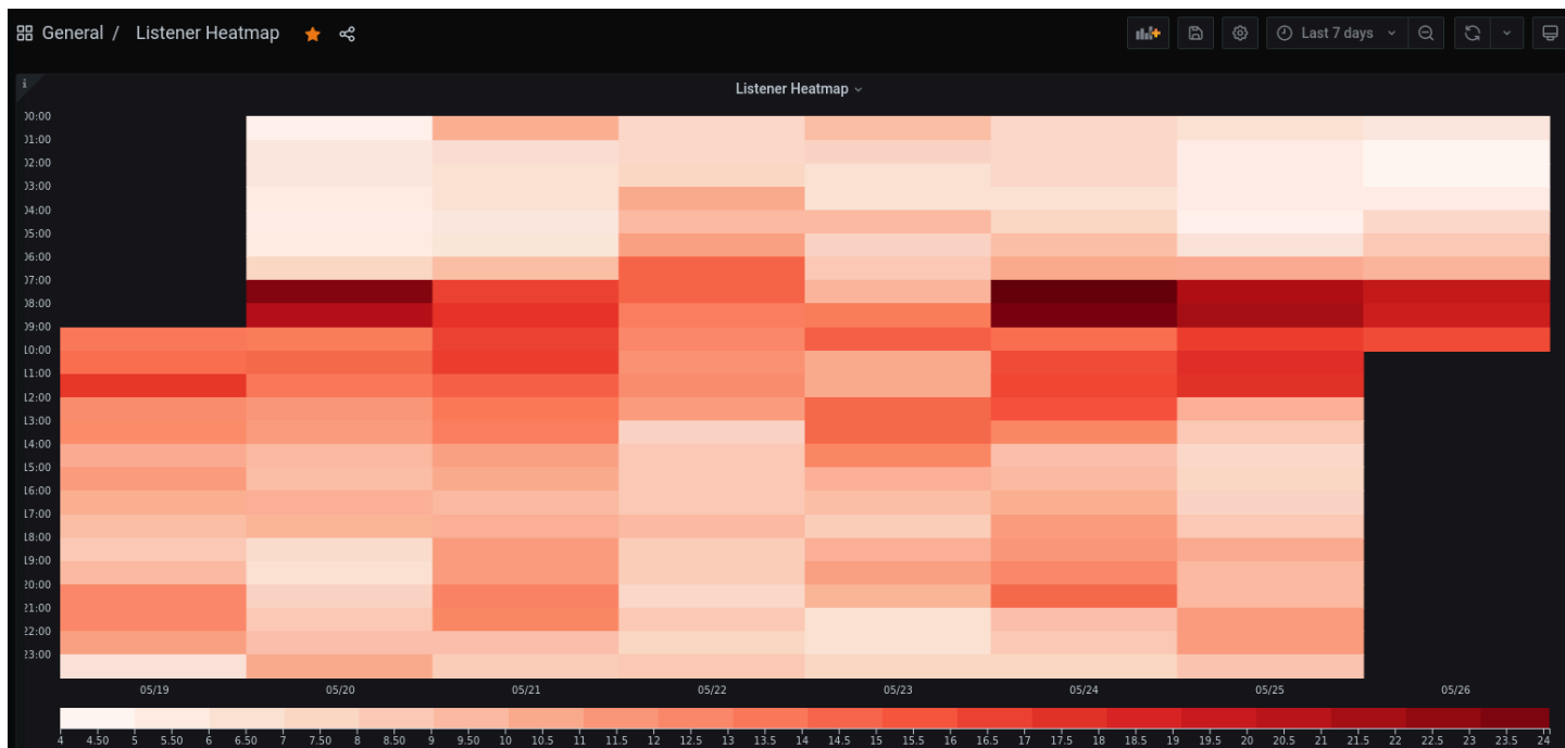
Sample Stream 7-day "Heat Map" (darker color means more listeners)